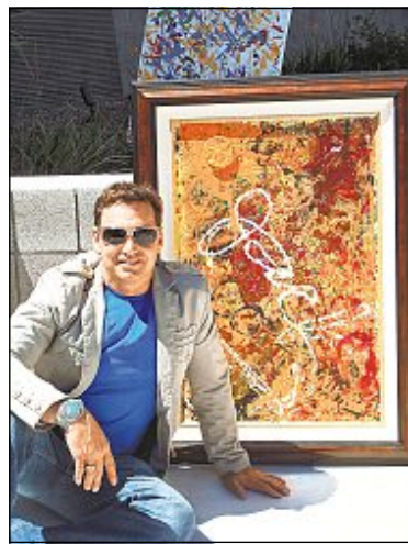
FRANÇOISE RHODES SPECIAL TO THE DESERT SUN