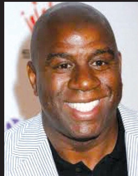
Magic Johnson's L.A. Premier of his HIV/AIDS docu-drama "The Announcement"