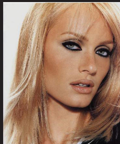
Supermodel Amber Valletta Emcees for Big Brothers Big Sisters Fashion Show