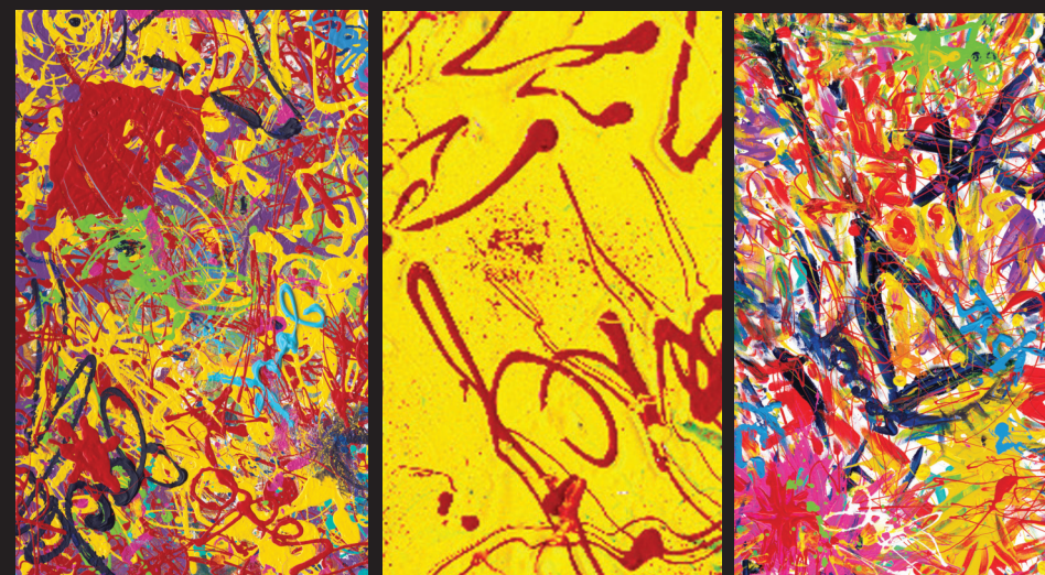
From Jack's Cosmic Art Collection. Visit the Cosmic Dream Museum Exhibit for more paintings: www.JackArmstrongArtist.com